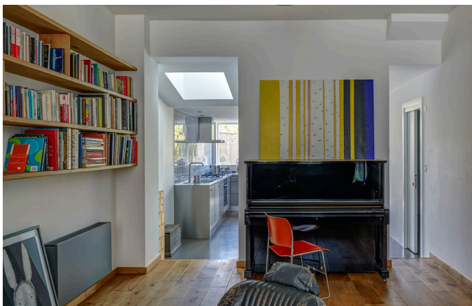
A new rooflight adds internal space, joining kitchen and living.

A Victorian terraced house in Brixton has been reconfigured to meet the needs of an artist and her growing family - transforming their home of 12 years into a light-filled, energy-efficient abode.