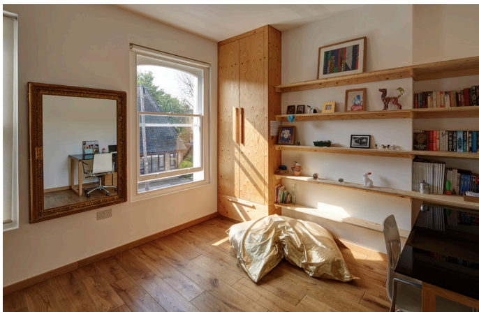
New oak flooring and bespoke storage has been installed throughout the house.