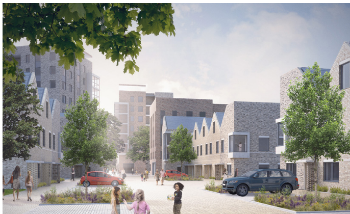
The buildings frame shared space, acknowledge long views and vary scale to create a lively layering in silhouette.