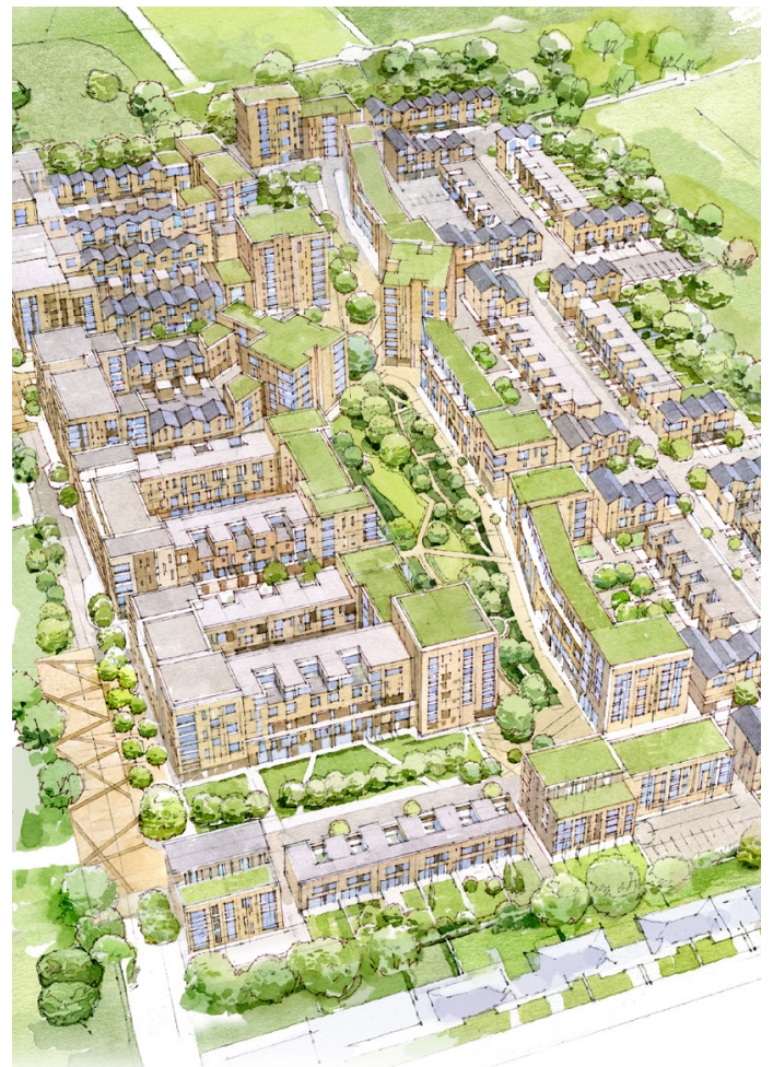
Overview of the Eastfields Redevelopment Masterplan. The central open space of the Linear Park provides a major connection through the site as well as a place to pause, relax, dwell and play.