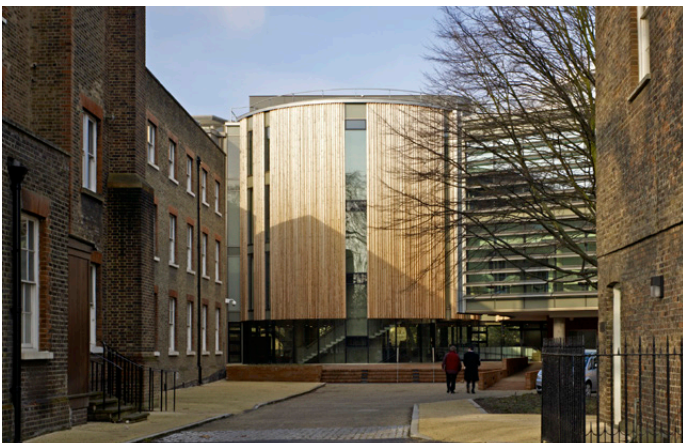
The new building is linked to the old by a timber and glass drum, which houses a circular reading room, and the ground floor reception area is entered through a newly created south-facing courtyard.