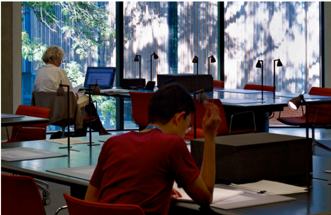
Circular Reading Room on the first floor adjacent the Rare Books and Illustrations Archive.

The new Herbarium is a beautiful, modern building and its curving forms sit sympathetically with a listed building and the magnificent trees on the bank of the River Thames.