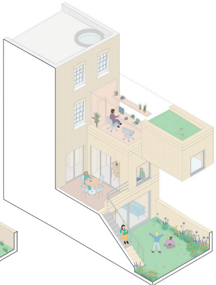
The remodelled home connects the family to the garden and provides new home working spaces for all.