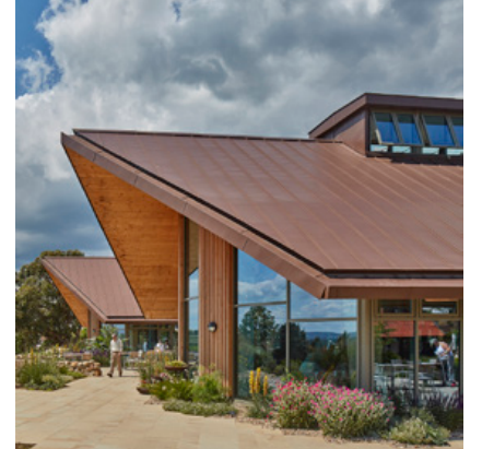
Above: Hilltop Lodge