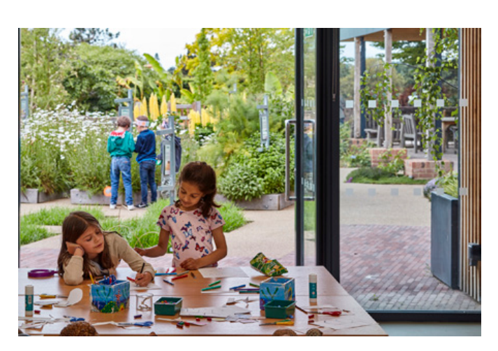
Above: Clore Learning Centre