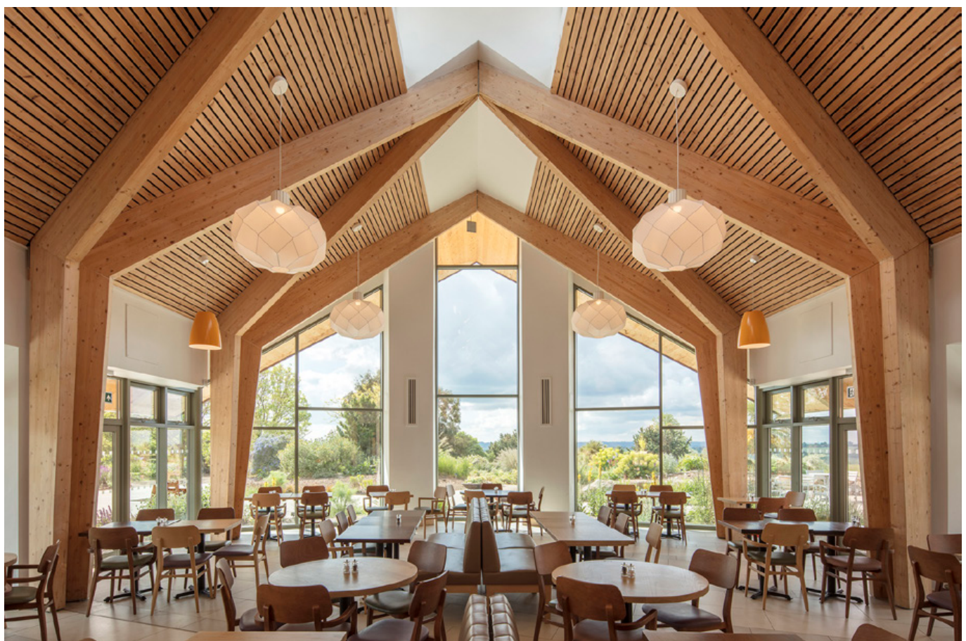
Above: Hilltop Lodge restaurant