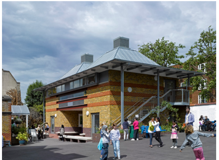
Above: Playground elevation.