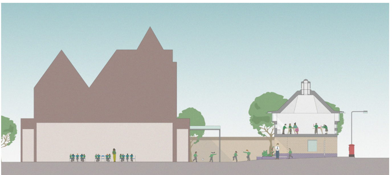
Above: Street elevation and section through the Gatehouse and the school hall.