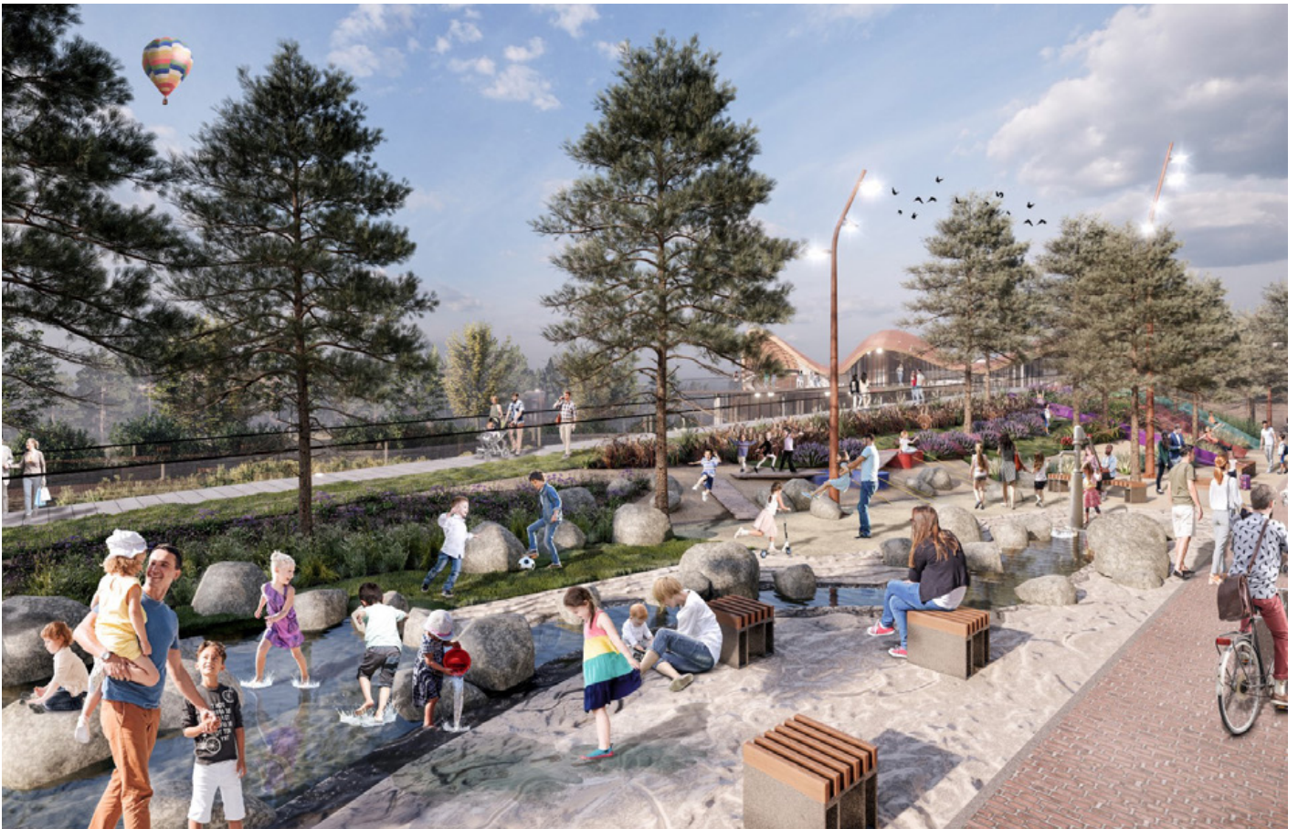
Areas for play are woven throughout the scheme. Spatial use is characterised by choice of landscape materials; passive places are predominantly planted, while active spaces are mostly paved.