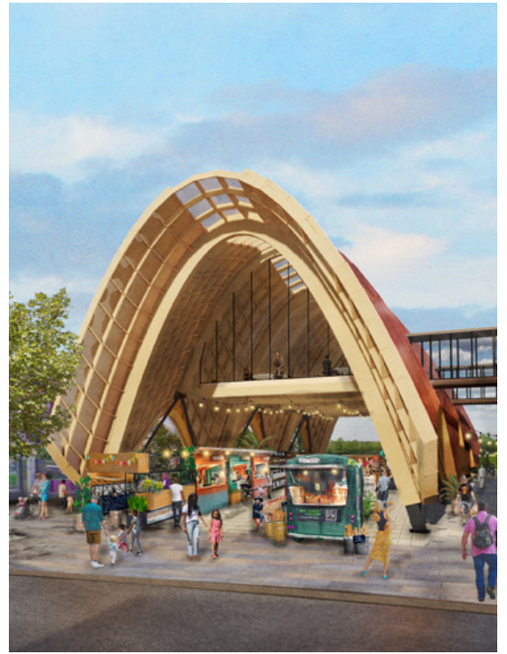
Co-working office space above a covered market. 'Subscribers' could use the facilities on a flexible basis.